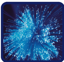
Optics, Photonics, Imaging & Lasers