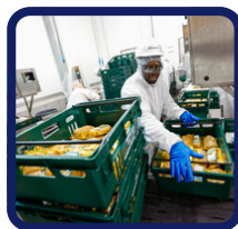
Food & Beverage Manufacturing